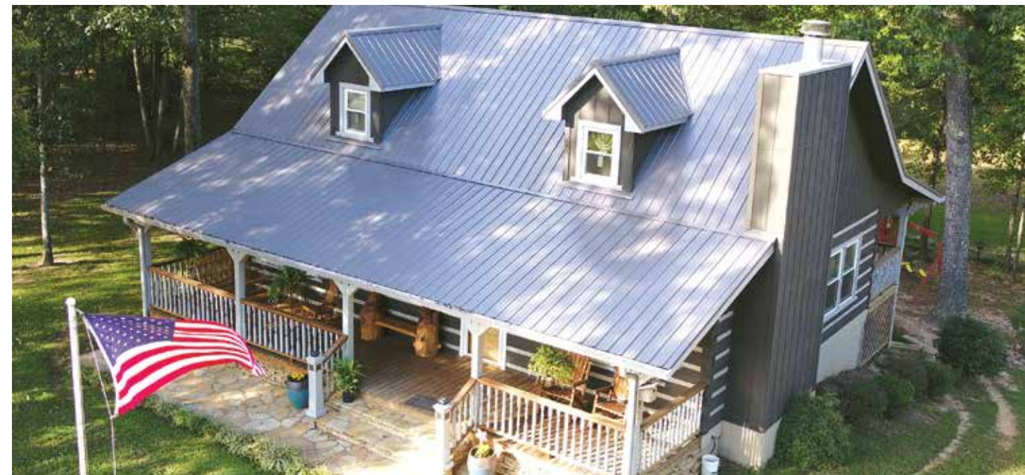
Panel-Loc Plus™, Charcoal