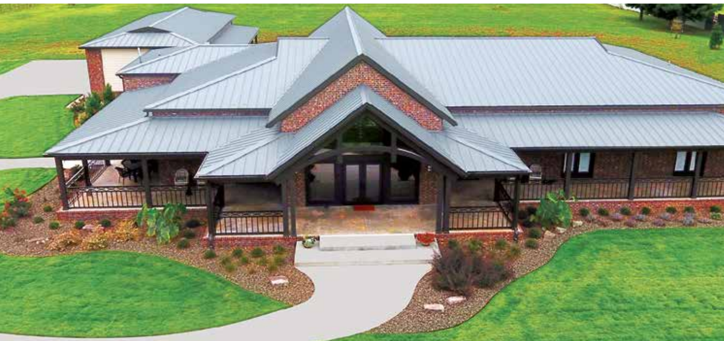
Central Snap®, Galvalume®