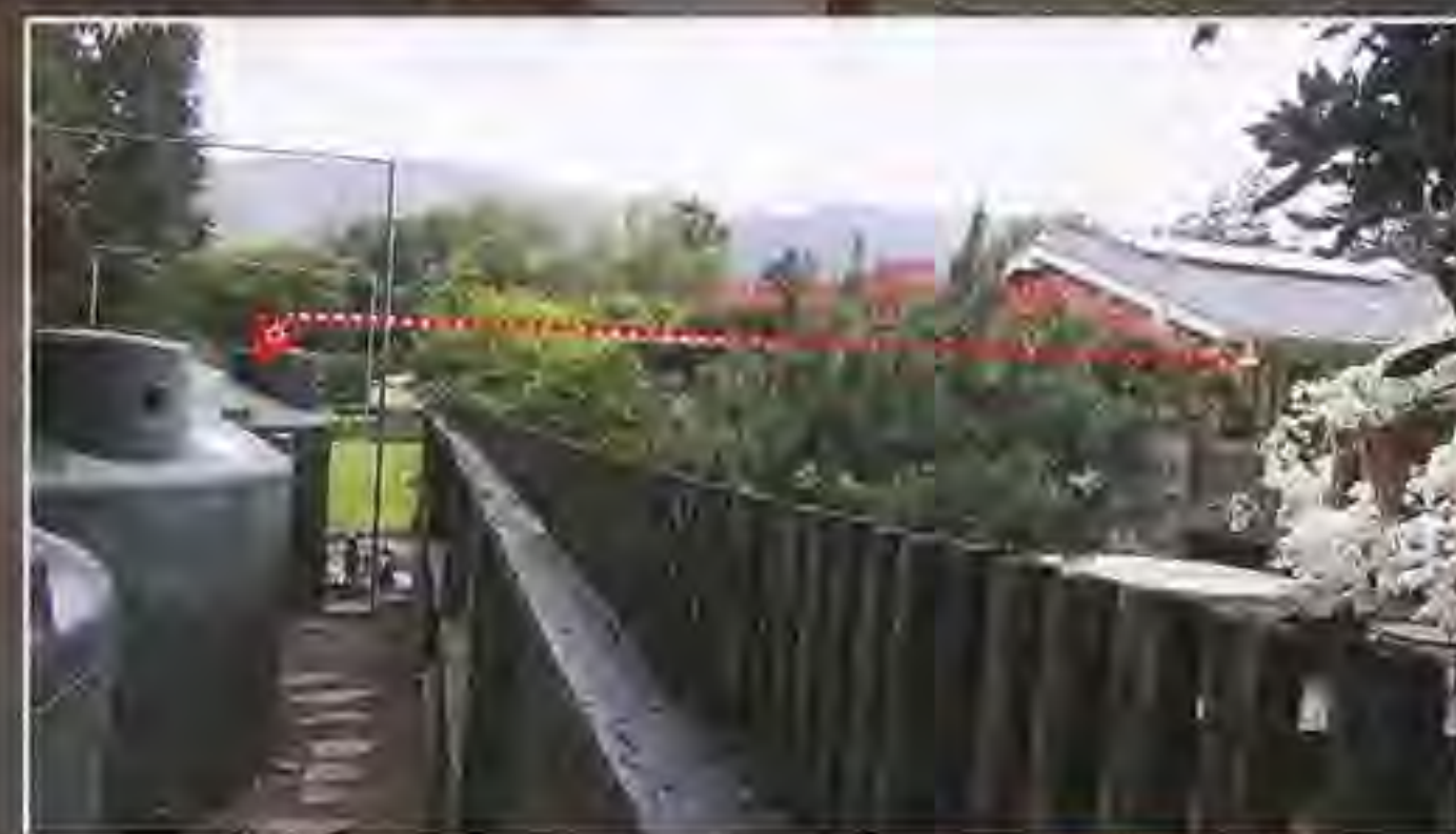
The conveyance tube is slanted towards the rainwater collection tanks so the tanks can fill up with clean fresh rainwater.