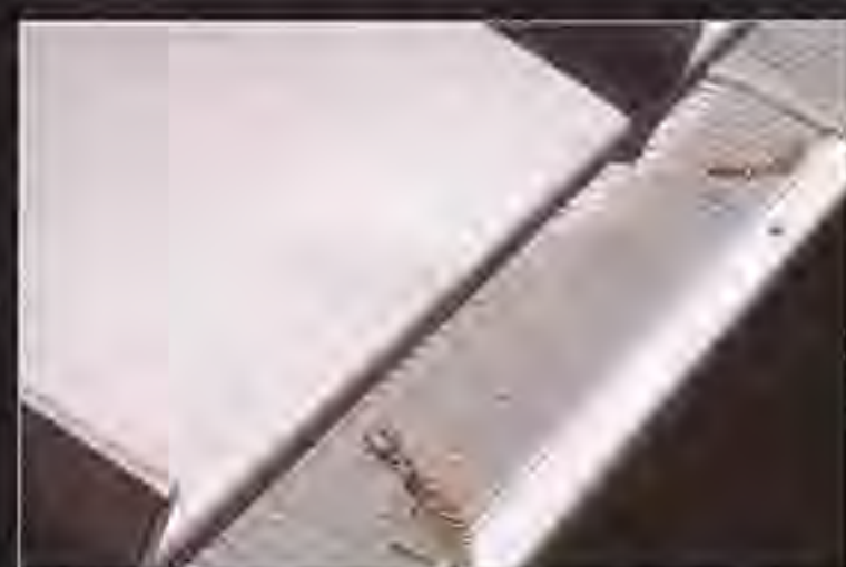
Standing Lock Metal