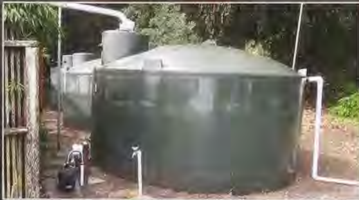
Three separate 5,000 gallon rainwater collection tanks can harvest a total of 15,000 gallons of rainwater. The rainwater is used by a homeowner to irrigate his drought tolerant plants in his landscape around his home.