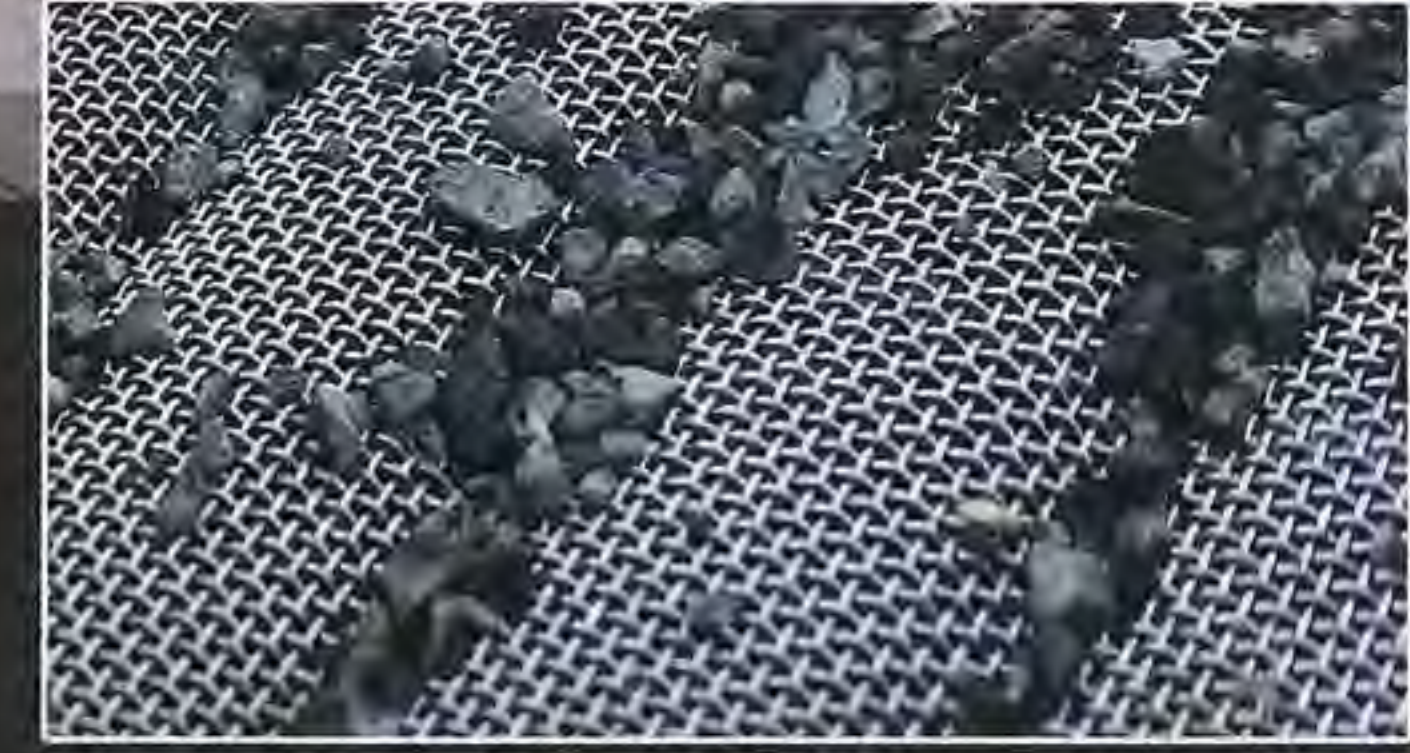
Filters even roof sand grit!