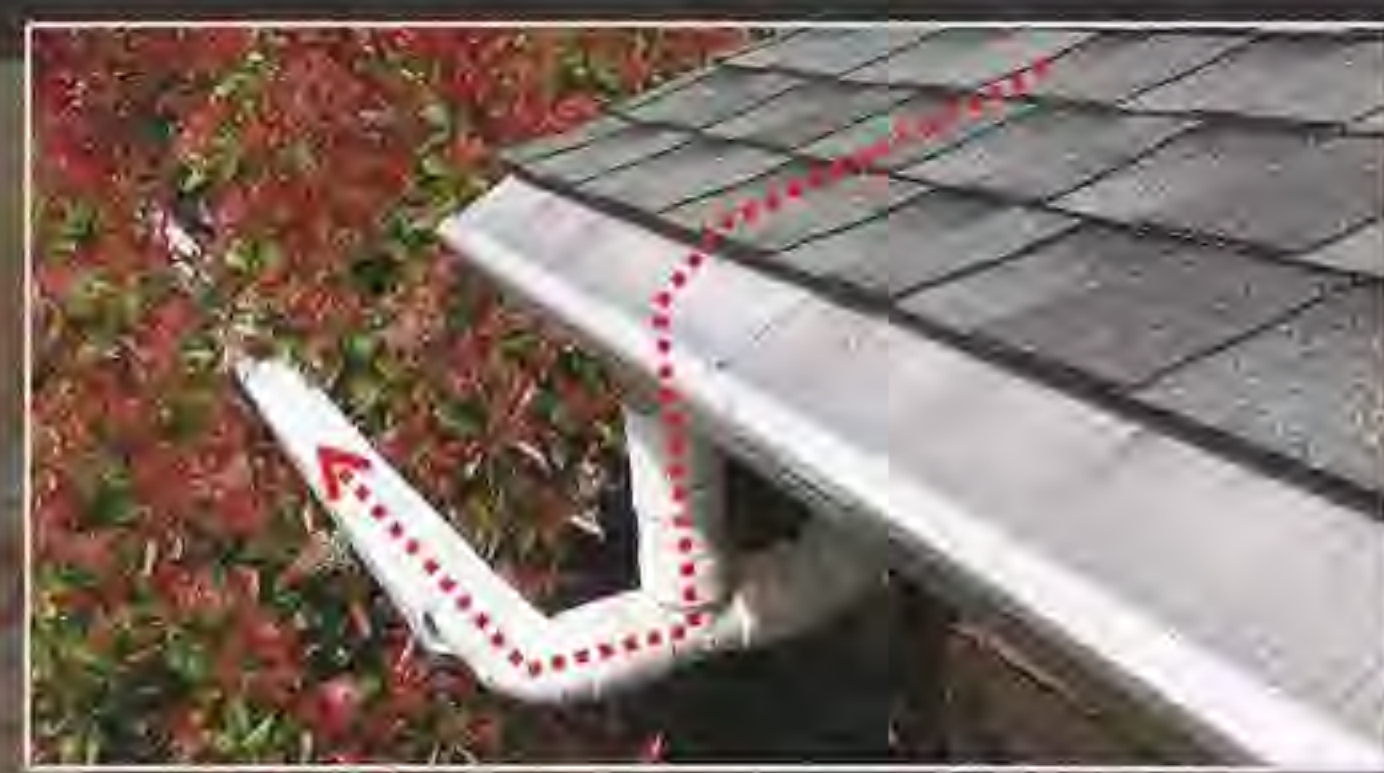
Rainwater travels down roof and into the gutter through the fine stainless steel mesh of Gutterguard. Then travels through the conveyance tube to the water collection tanks.

Leaf Blaster Gutterguard is widely used in rain-water collection because of its ability to keep out leaves, pine needles and roof sand-grit from the gutter and rainwater collection tank.